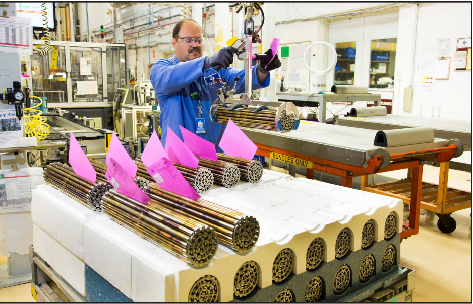
Packing fuel bundles for shipment at Cameco Fuel Manufacturing in Port Hope.

On June 8, Cameco announced that unionized employees at Cameco Fuel Manufacturing in Port Hope and Cobourg have voted to accept a new collective agreement.