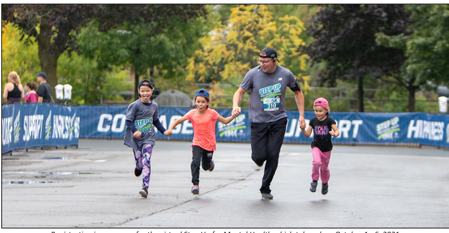
Registration is open now for the virtual Step Up for Mental Health which takes place October 1 - 6, 2021.

Registration for the Cameco Charity Golf Package is open now, and participants can pick a day