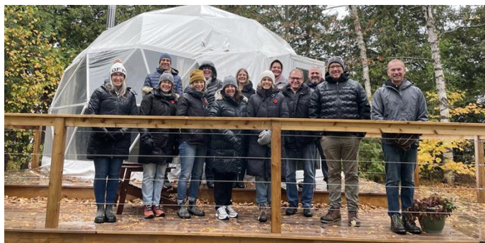
Cameco representatives visiting Curve Lake First Nation's geodome.

On land, the community tour showcased CLFN's Aquaponics facility, currently in its late development stage combining aquaculture and hydroponics in the same greenhouse facility. Another key highlight was the newly constructed water tower, a landmark that has begun to transform the community's landscape.