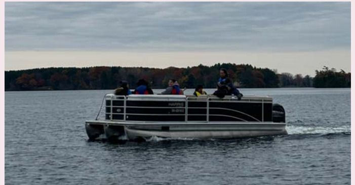
CLFN representatives took Cameco staff on a boat tour during the community visit in October 2024.

The Environmental Working Group (EWG) serves as a platform for collaboration and the exchange of information on shared environmental interests with respect to Cameco's operations. In 2024, the EWG met three times making progress toward the groups objectives to explore a harvest food study and scholarship program for CLFN as well as participate in tours of Port Hope's Conversion Facility and Cameco Fuel Manufacturing.