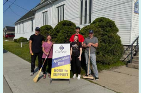
More than 60 Blind River Refinery employees participated in our annual Cameco Cares Day, completing 23 jobs across our communities.

Each year, this event is an opportunity for Cameco to give back and beautify the spaces where employees and their families live, work, and play as well as strengthening our involvement in our local communities.